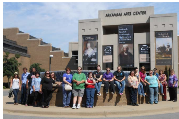
Members of BRTC's Art Club visited the Arkansas Art Center and the William J. Clinton Presidential Library during a trip to Little Rock.