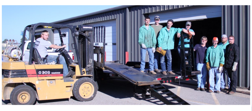
Welding students stand with the metal ARI donated to the welding program.

American Railcar Industries (ARI) donated a shipment of scrap metal to Black River Technical College's welding program on the Pocahontas campus. Weld-