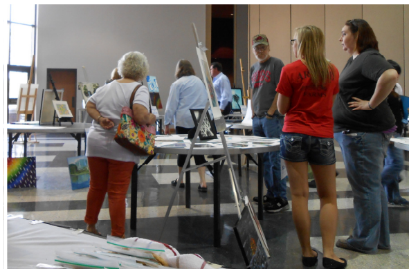
Guests browse the artwork available for sale at the Art Showcase.

On Monday after the showcase, members of the Art Club and BRTC staff volunteered to run a stand in the student lounge of the administration building to sell items remaining from Sunday's sale. "This