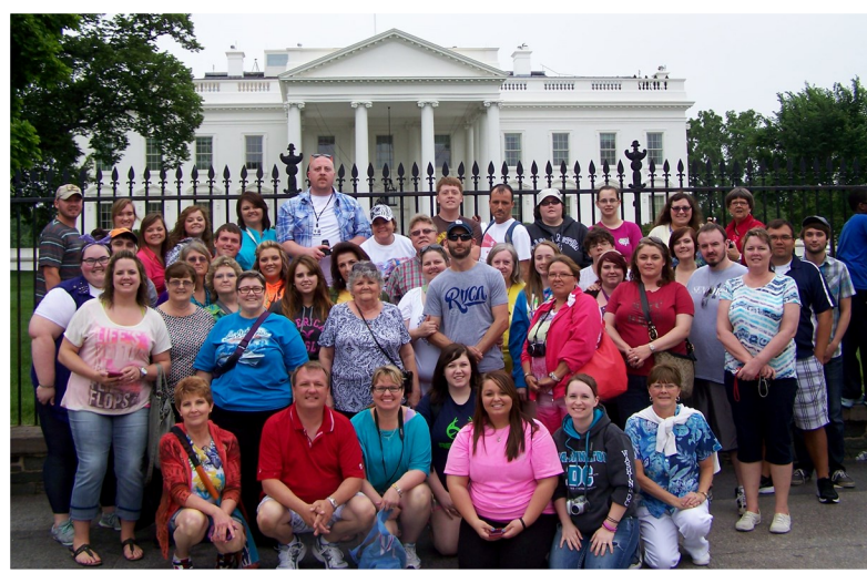
BRTC faculty, staff, students and members of the community pose for a picture in front of the White House while on a recent trip to D.C.

The group also toured the United States Holocaust Memorial Museum, and also had the opportunity to visit different Smithsonian Museums of their choice, such as the Natural History Museum, the American History Museum, and the