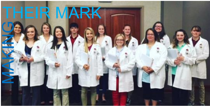
2016 M*A*S*H Camp attendees