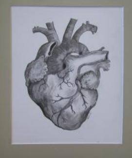
Left : Graphite pencil drawing by Autumn Dildine for the fall Science Symposium

Because supplies are costly, you can help students by donating funds for art supplies. With your help, art students will be able to improve their talent!