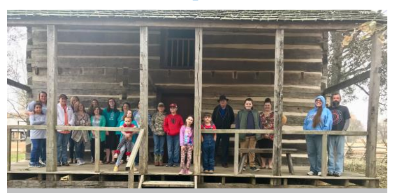
Students, teachers, and parents on the front porch of the Rice-Upshaw House.

the site's scavenger hunt by using the interpretive signs to find the answers. They also enjoyed playing games from the time period such as drop the clothespin and ring toss.