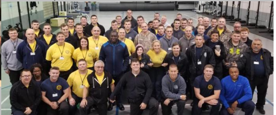
BRTC Law Enforcement Training Academy Class 2018B