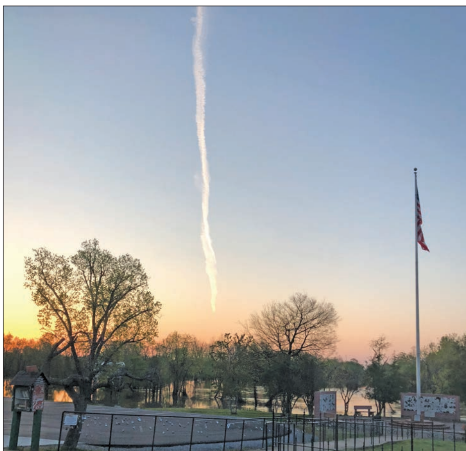
This large contrail appears to be hanging eerily from the sky on Wednesday morning just before sunrise. Contrails are line-shaped clouds produced by aircraft engine exhaust or changes in air pressure. The photo was taken at Overlook Park on the Black River.