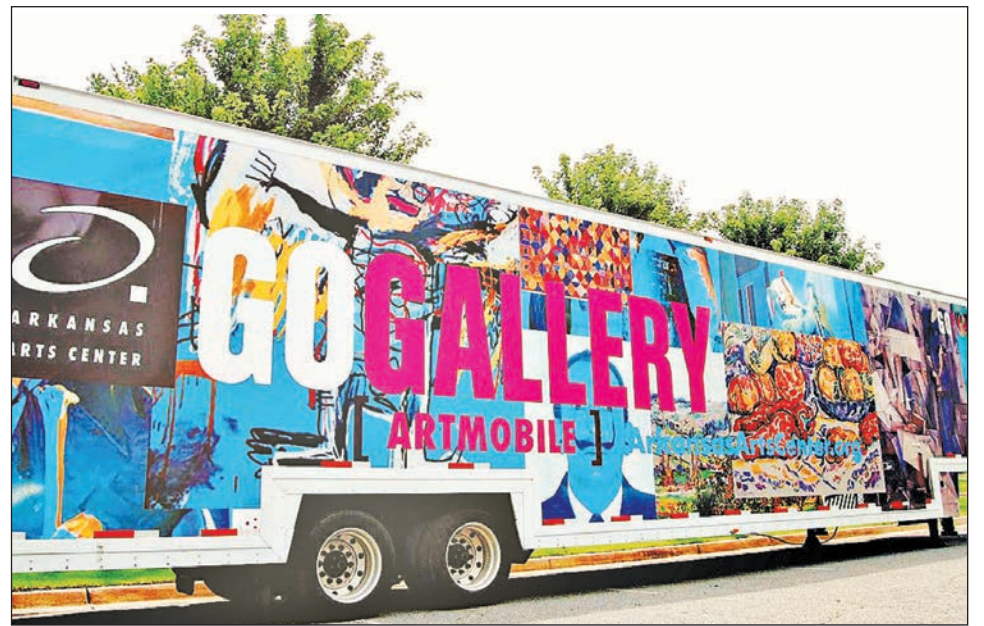
The Arkansas Arts Center Artmobile is one of only a handful of mobile art museums in the nation.

Food is a treat that See ARTMOBILE page 2A