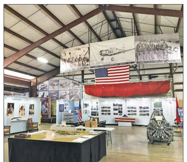
The interior of the Wings of Honor Museum from their Facebook page.