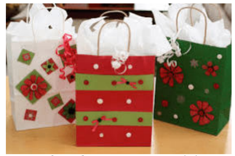
Dec. 1 — The Student Government Association (SGA) will offer its fourth annual BRTC Day of Caring. This event is for current students only, so a student I.D. must be shown. As part of this event, SGA will be giving away new toys for each child of a BRTC student! There are some wonderful toys ... Read in browser »