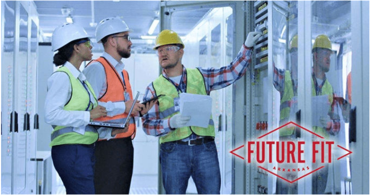
POCAHONTAS, AR. Oct. 23—Black River Technical College is offering Future Fit Training, provided at no cost, for those who are unemployed, underemployed, or who want to learn new skills for a better job. A recent study by the Manufacturing Institute showed that nationally 80% of manufacturers report a moderate or serious shortage of qualified applicants ... Read in browser »

By Elizabeth Collins on Oct 23, 2020 09:00 am