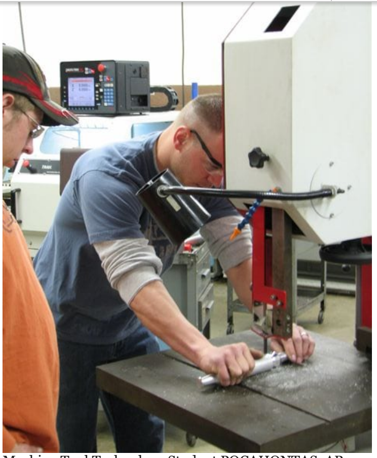
Machine Tool Technology Student POCAHONTAS, AR Aug. 20 — Black River Technical College in Paragould is expanding its technical credit offerings to better meet the needs of local industry. For Fall 2020, students in the Paragould area will be able to take machine tool technology classes at BRTC Paragould. Students have the opportunity to get ... Read in browser »