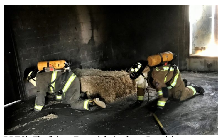
BRTC's Firefighter Essentials Students Practicing Searching Skills POCAHONTAS, AR Oct. 15—During