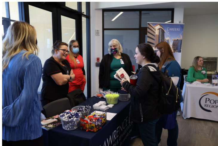
RN Job Fair at BRTC