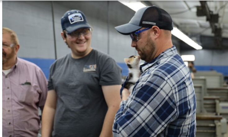
Tuesday, October 26, 2021, Clip from Good Morning Region 8 Read in browser »