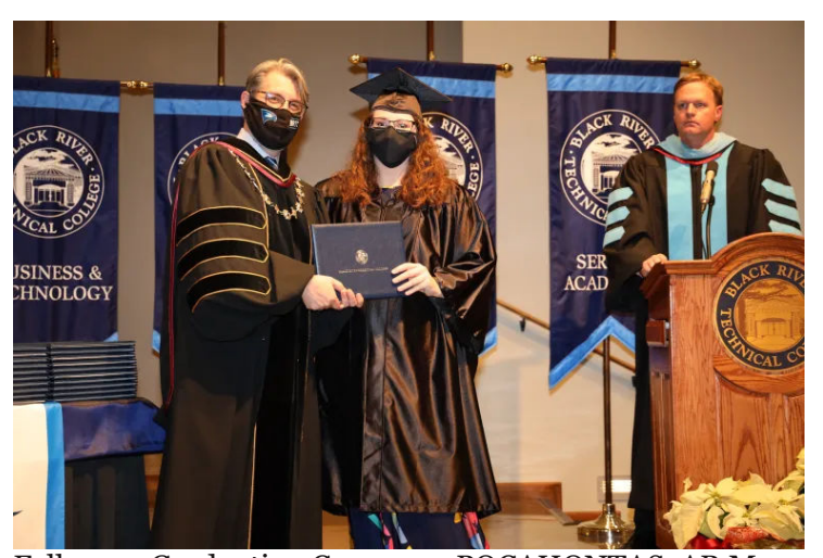
Fall 2020 Graduation Ceremony POCAHONTAS, AR May 4— Black River Technical College's Spring 2021 graduation ceremony will be held in the Randolph County